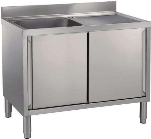
132818 (MLA1216DXN) Cupboard sink with 1 bowl 600x500mm, right hand drainer and 2 sliding doors, 1200mm